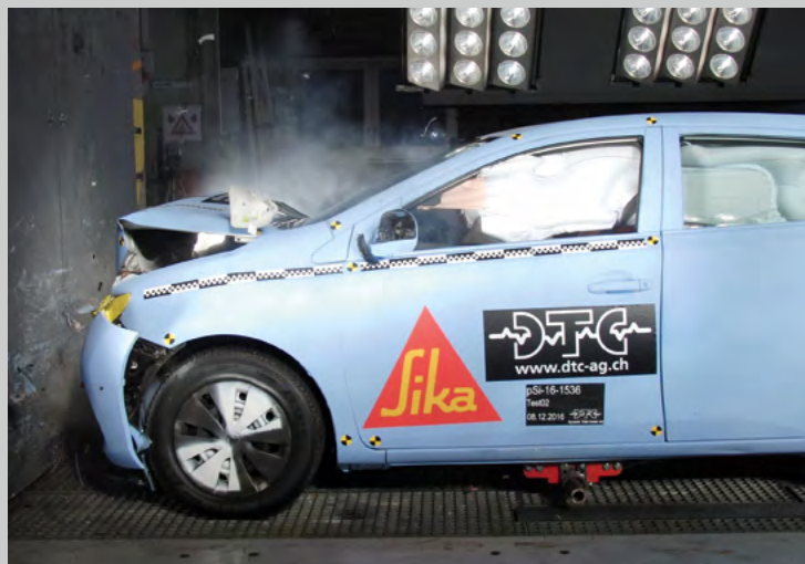
WITH SIKA YOU ARE ON THE HIGH ROAD TO SAFETY.

SikaTack® DRIVE is compatible with both installation processes offered by Sika. The Black-Primerless delivers the fastest application process for the standard auto glass related applications whereas using the All-Black solution lets you keep inventories smaller by just using one Pre-Treatment product for all process steps.